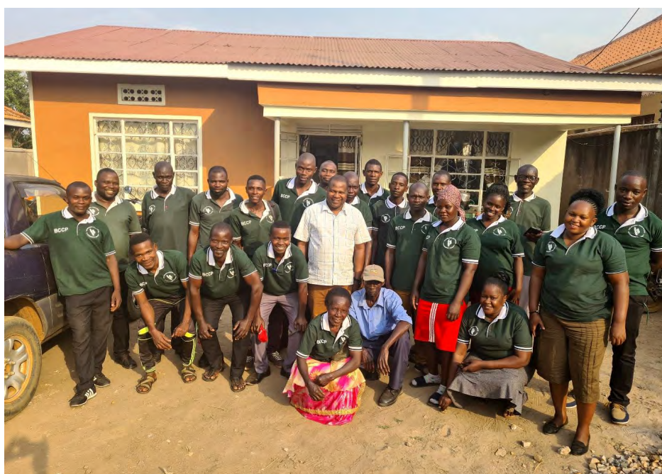
BCCP Team Members