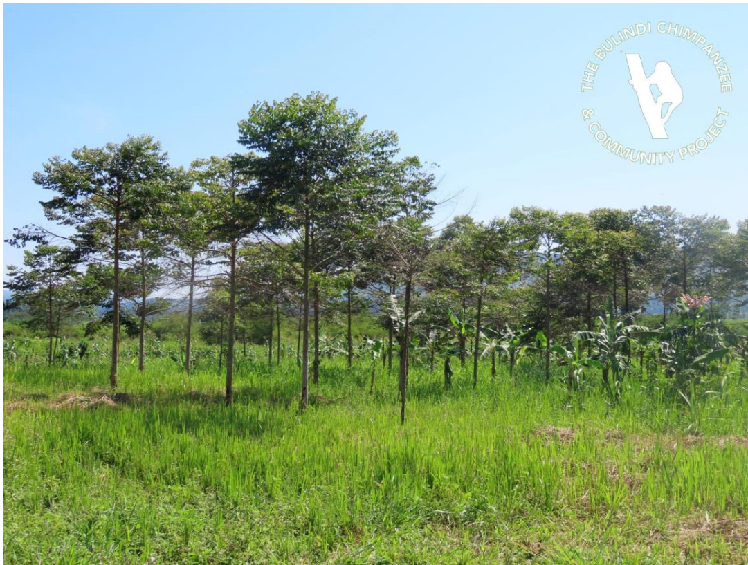
Three year old Maesopsis and Khaya trees (both indigenous forest species) planted in Kyamuchumba village in 2018. Since 2017 BCCP has raised and supplied over 5 million trees to farmers in the Budongo-Bugoma corridor.