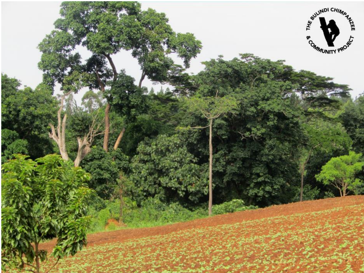
Small forest used by the Wagaisa chimpanzees, conserved through the Schoolchild Sponsorship program for private forest owners.

In 2023, BCCP supports 60+ private forest owning families , many of whom have several children in school. This program is enabling ongoing conservation and regeneration of 260 acres of natural forest – and growing. These forests are critical to the chimpanzees and also provide critical watershed for local farmers.