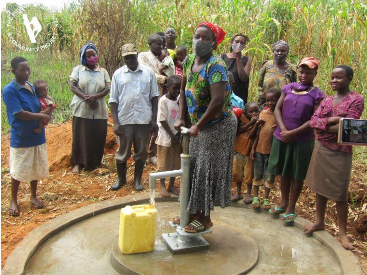
Residents of Mbiwe village (Wagaisa area) using their new water well (July 2021)

The project builds village wells (boreholes) to provide local households with clean and safe water, helping to reduce the incidence of waterborne diseases. Additionally, the wells mean that villagers no longer collect water from streams inside the forest where they risk running into chimpanzees! With help from water charity partners, BCCP has constructed and maintains 57 water wells , providing clean, safe water for thousands of residents.