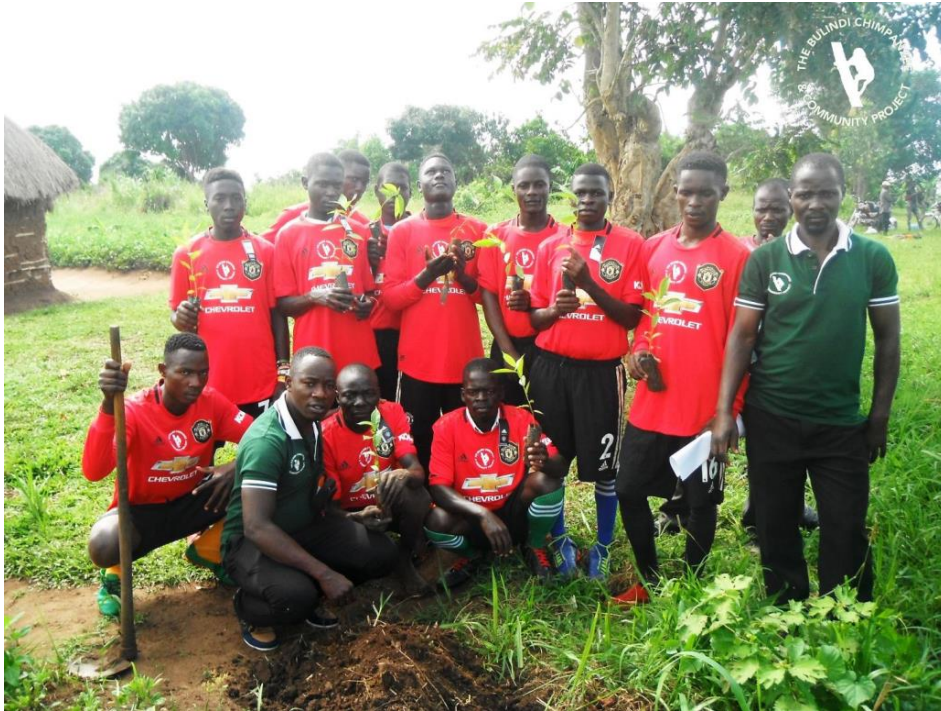
ABOVE PHOTO: Kiziranfumbi Football Club in their new kits are holding tree seedlings to plant before their match against Kitabona FC during our 2021 Chimpanzee football Tournament.

The 2023 'Chimpanzee Football Tournament' was the most successful and popular yet, with 22 local teams competing for the coveted trophy!